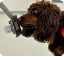
Parkinson's research announced. This study has been supported by the Michael J Fox Foundation