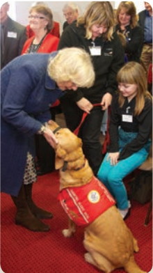
20th February 2013 HRH Duchess of Cornwall visited the centre