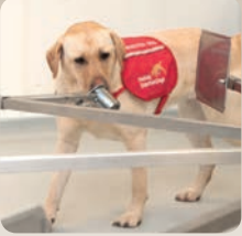
Expanding our research beyond cancer, our Malaria detection research begins; in collaboration with the London School of Hygiene and Tropical Medicine and MRC Gambia, and part funded by the Bill and Melinda Gates Foundation