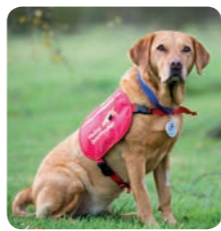
Cancer Detection Dog Daisy awarded the Blue Cross Medal for her pioneering work in the field of cancer detection