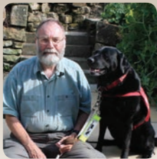
Cherry & Zeta: first Diabetes partnership