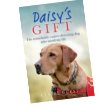
Daisy's Gift published