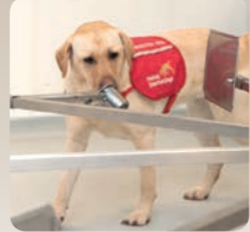
Expanding our research beyond cancer, our Malaria detection research begins; in collaboration with the London School of Hygiene and Tropical Medicine and MRC Gambia, and part funded by the Bill and Melinda Gates Foundation