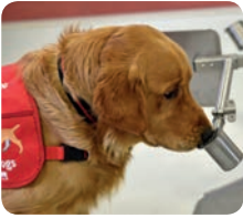
Urological cancer research in collaboration with Milton Keynes University Hospital announced