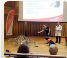
We hosted the first international Bio Detection conference at Cambridge University