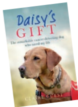
Daisy's Gift published

New purpose built training facilities and refurbished John Church Bio Detection Centre opening at our centre in Great Horwood