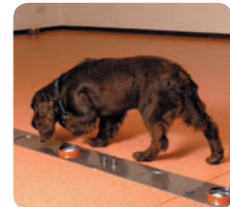
30th October 2015 Tangle the BMJ Cancer Detection dog died after 12 years of service