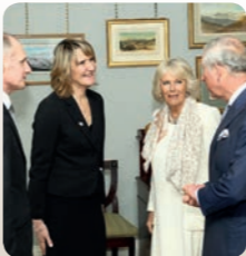
HRH Duchess of Cornwall became our Patron