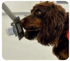
Parkinson's research announced. This study has been supported by the Michael J Fox Foundation