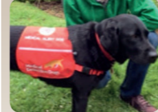
Judy the first CCHS (Congenital Central Hypoventilation Syndrome) Assistance Dog