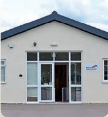
Medical Detection Dogs moved to a new headquarters in Great Horwood, near Buckingham