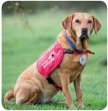
Cancer Detection Dog Daisy awarded the Blue Cross Medal for her pioneering work in the field of cancer detection