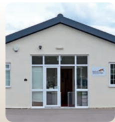
Medical Detection Dogs moved to a new headquarters in Great Horwood, near Buckingham

Peer reviewed study Canine screening of bladder cancer using urine samples published in Cancer Biomarkers