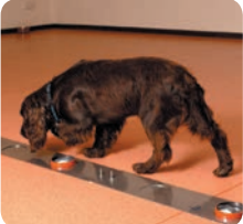
30th October 2015 Tangle the BMJ Cancer Detection dog died after 12 years of service