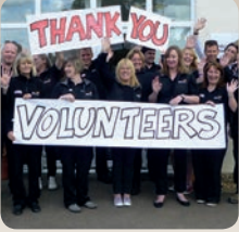
Over 600 Volunteers support the charity