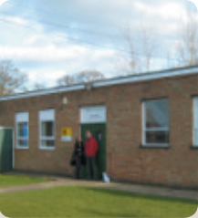
Opened first HQ in Westcott, in a leaky, cold office space