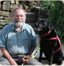
Cherry & Zeta: first Diabetes partnership