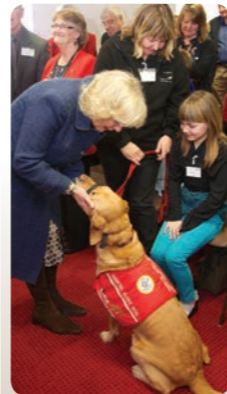
20th February 2013 HRH Duchess of Cornwall visited the centre