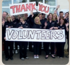
Over 600 Volunteers support the charity