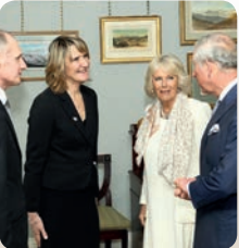
HRH Duchess of Cornwall became our Patron