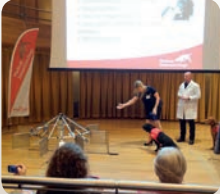
We hosted the first international Bio Detection conference at Cambridge University