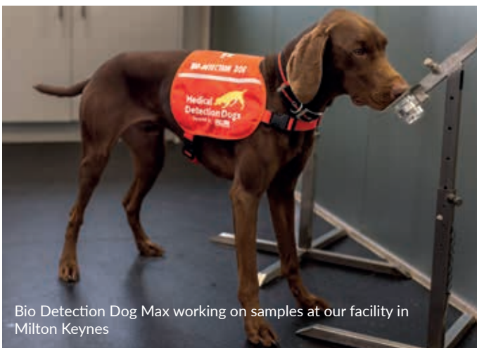
Bio Detection Dog Max working on samples at our facility in Milton Keynes

Our Bio Detection Dogs are trained to find the odour of those diseases in samples such as urine, breath and sweat and our work has the potential to benefit millions.